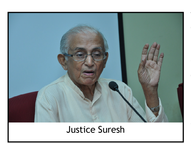
Plenary 4: The Human Rights Approach to the Problem of Violence Speakers - Justice Suresh (Chairperson), Meera Velayudhan, Jyoti Punwani

Suresh, Justice judicial activist, emphasized that human rights provisions in the Constitution should be accessed and exercised more by people of the country. He suggested that human rights approach can be a meaningful framework for development. He also pointed out that human rights are obligation of the